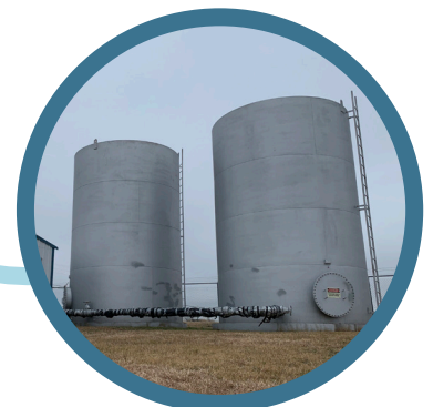
3: Storage Tank